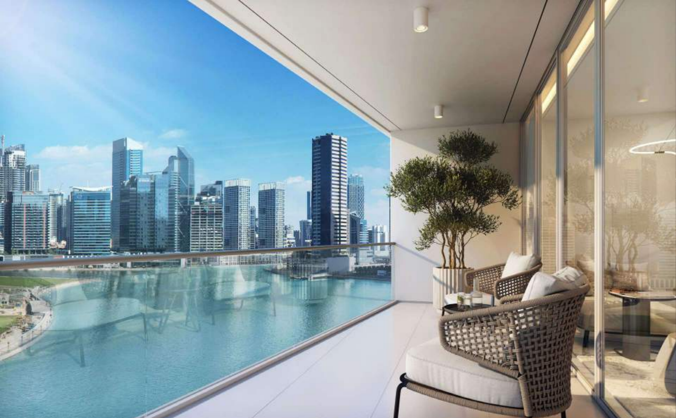
NORTH-EAST DAY VIEW