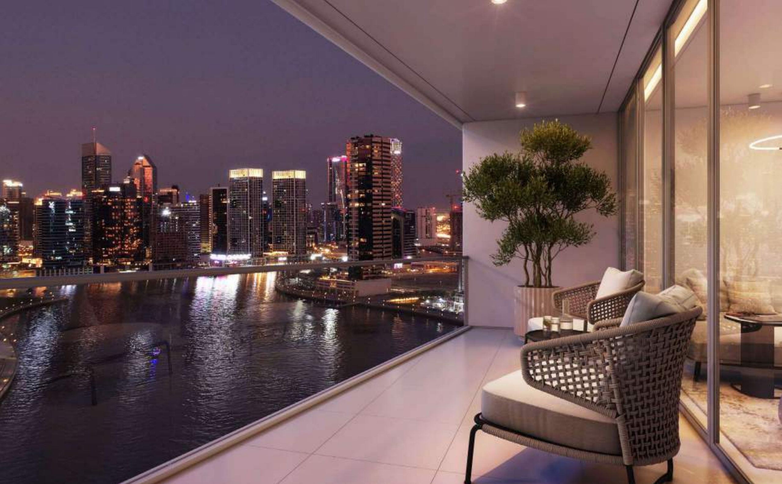
NORTH-EAST NIGHT VIEW